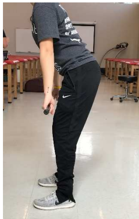
Figure 1. Starting point of the RDL